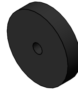
② Isometric view Scale 4:1