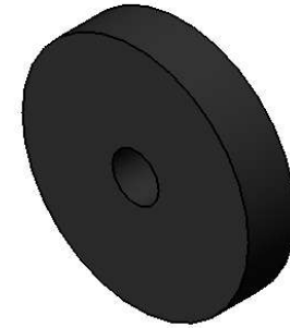
② Isometric view Scale 4:1